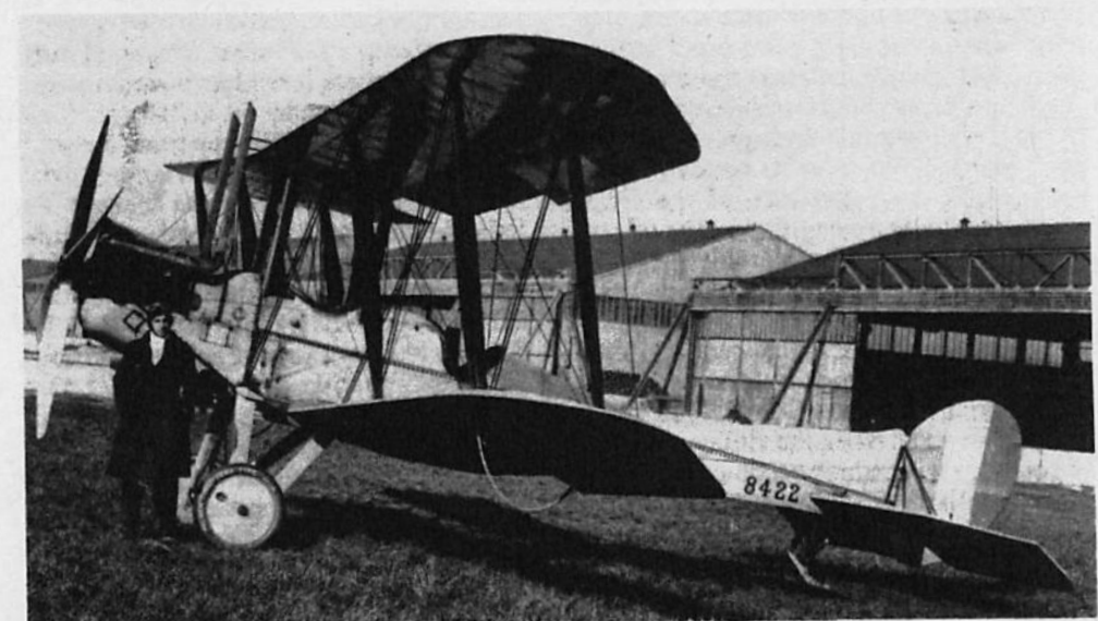
The BE2c - an ex World War I trainer

The origins of flying at Cranwell date back to before the official records of the RAF. The site of Cranwell was requisitioned in 1915 by the Royal Navy to become a Naval Air Station. In 1918 the station was transferred to the newly formed Royal Air Force who renamed it Cranwell. A subsequent Act of Parliament established Cranwell as a military air academy, the first in the world, and in February 1920 the first formal flying course began.