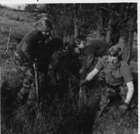
SERE draining National Trust land in Derbyshire.

In Professional Studies the students receive a basic introduction to Officers' Responsibilities. Duties and Regulations, Customs Etiquette and Social Responsibilities, Signals and Casualty Procedures, Accounts, Supply, Personnel, Welfare, Flight Safety and Air Force Law. Instruction in the conventions of Service Writing is consolidated by the submission of narrative entries in the second and final week of the course during which the students make progressive comments on their training and incidentally provide valuable feedback to the DS. Further consolidation in this area is effected by the office simulator phase which takes place in the final week with all students playing the role of junior officers on a typical RAF station and coping with a variety of day to day problems. The simulator exercises are designed to put into perspective the whole of the professional studies aspect of the course, from welfare interviews to signal writing and Air Force Law. To develop skills and confidence in oral communications the students are given the opportunity to practise briefings and 5 and 10 minute talks in front of their respective flights and the CCTV cameras. This is an experience new to most of them and