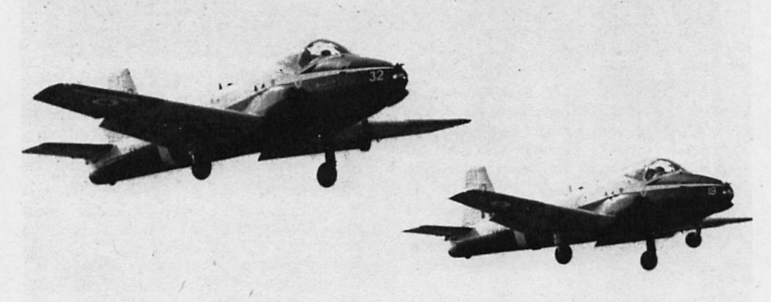
the Jet Provost Mk 5a - Formation Take Off

Over a span of 65 years the method of instruction has been developed and refined. The first Commandant of HMS Daedalus attended a 2 week course; he spent the first