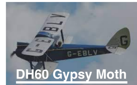
DH60 Gypsy Moth