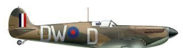
610 Sqn Spitfire Ia (Of Battle of France)

The Dunkirk evacuation commenced after large numbers of Belgian, British, and French troops were cut off and surrounded by German troops during the six-week Battle of France. In a speech to the House of Commons, British Prime Minister Winston Churchill called this "a colossal military disaster", saying "the whole root and core and brain of the British Army" had been stranded at Dunkirk and seemed about to perish or be captured. In his " We shall fight on the beaches " speech on 4 June, he hailed their rescue as a "miracle of deliverance".