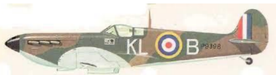
54 Sqn Spitfire I (of Air Cdre Al Deere, Asst Cmdt Cranwell 1963/4)