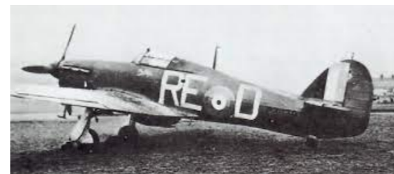
229 Sqn Hurricane I